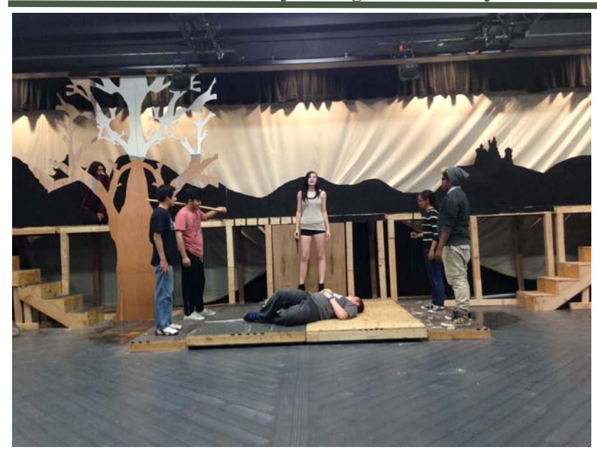
"Coyote Drama Productions at Madera High School Presents"

Visual & Performing Arts News of Madera Unified School District